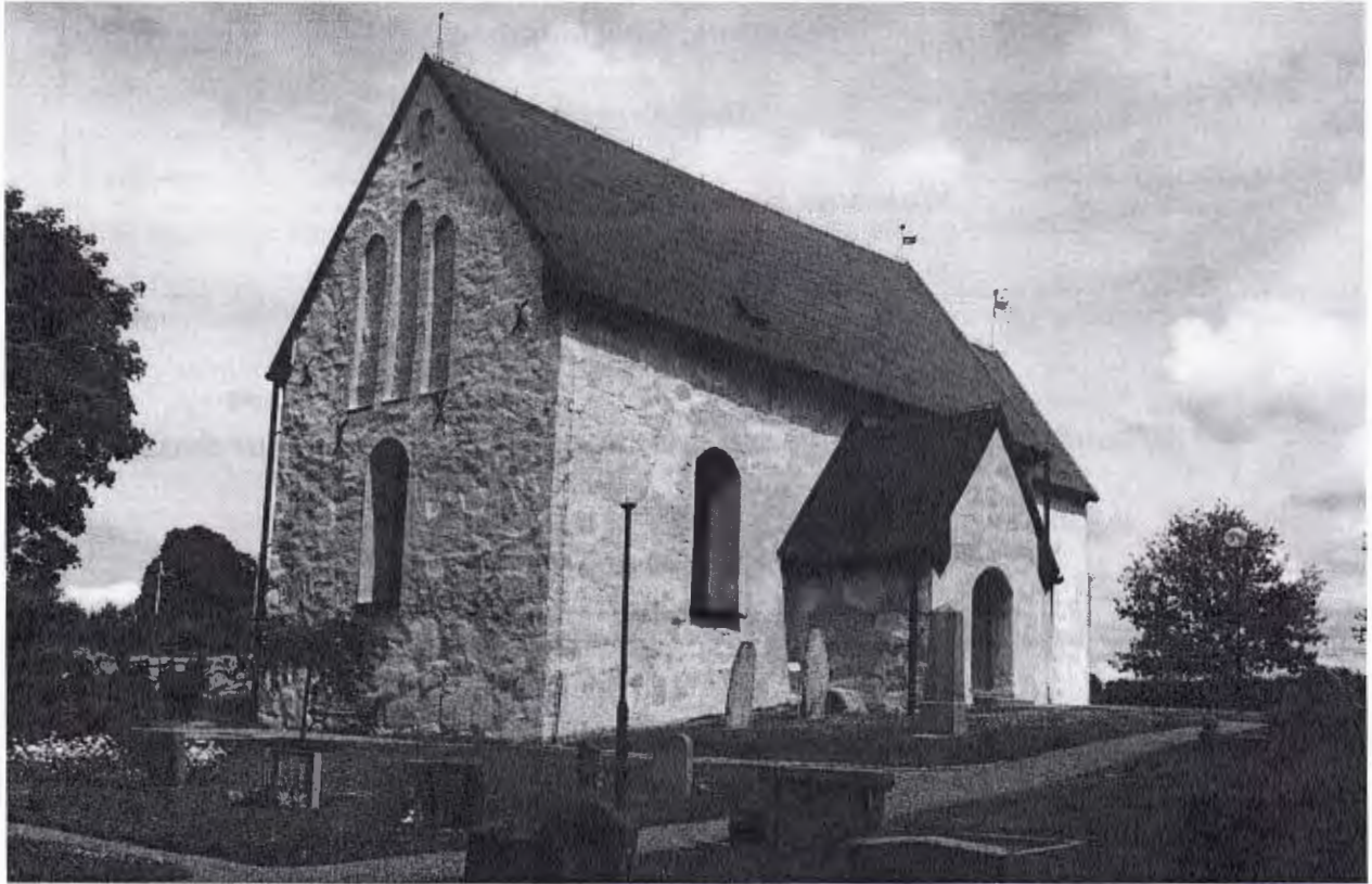
ORKESTA KYRKA, SWEDEN